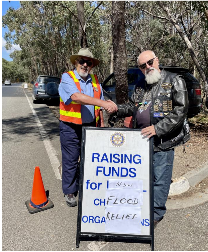
The Editor with members from the Rotary Club of Seymour raising funds for NSW Flood Relief.