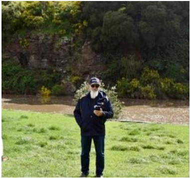
D’Prez - attending a zoom meeting on Sunday with District on the subject of Membership - while attending “The Lift the Lid Walk” at Coburg Lake.