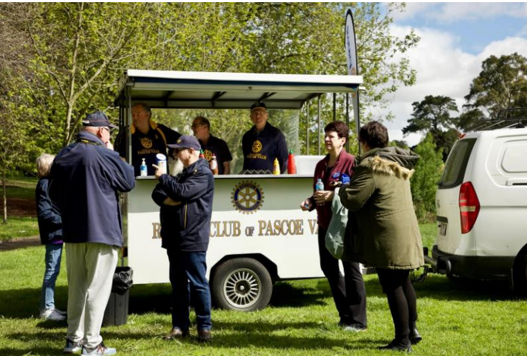
Nothing beats a Rotary sausage at the end of a hard walk Well Done Moreland!