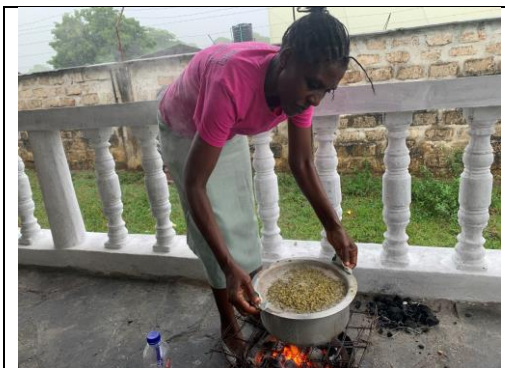
Cooking at Umoja