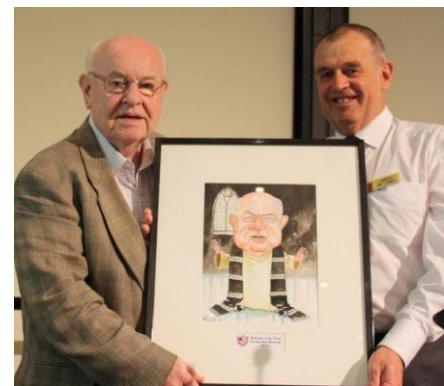
Father Bob, receiving his Bastard of the Year Award

It is with heavy heart we say farewell to our Honorary life member, and 2010 Bastard of the year Fr Bob, the larrikin priest who was a loved member for many years. you will be sadly missed Farewell you old bastard. The committee and members of the International Order of Old Bastards pass on their condolences to Fr Bob's Family.