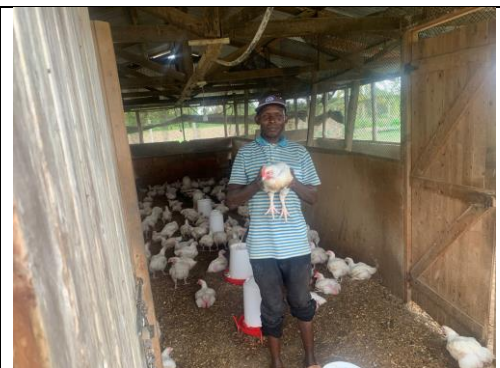
The orphanage is a working farm, selling produce to the locals