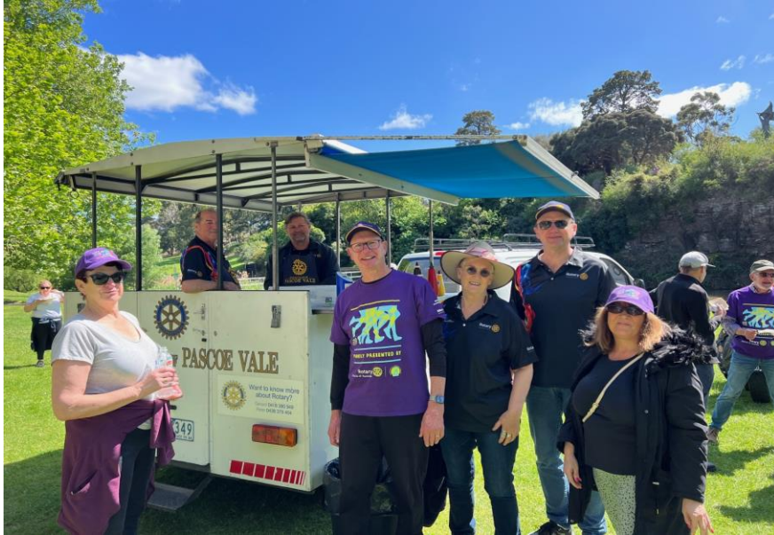
PVR Members at the "Lift the Lid" Walk