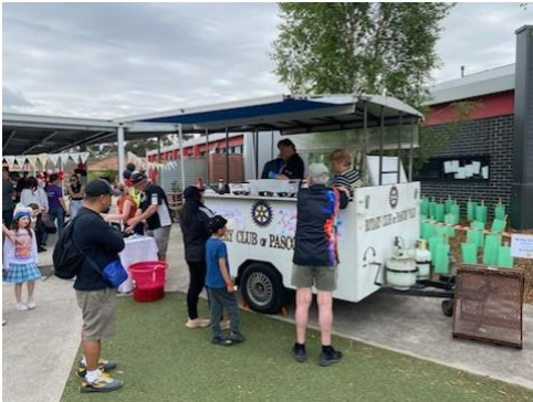
The BBQ trailer in action