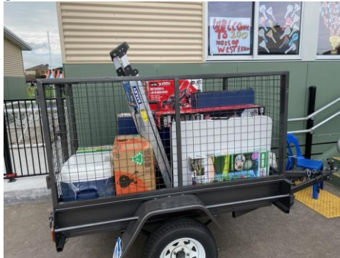
The raffle prize