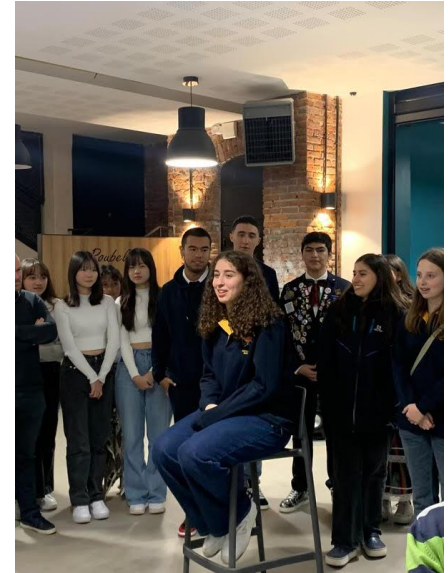
Me speaking in French at the Rotary meeting in Maubeuge

Overall, my first few weeks have been an amazing, once in a lifetime experience which I am extremely grateful to have.