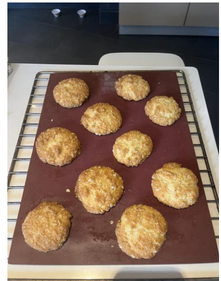
Some of the ANZAC biscuits I baked with my host mum